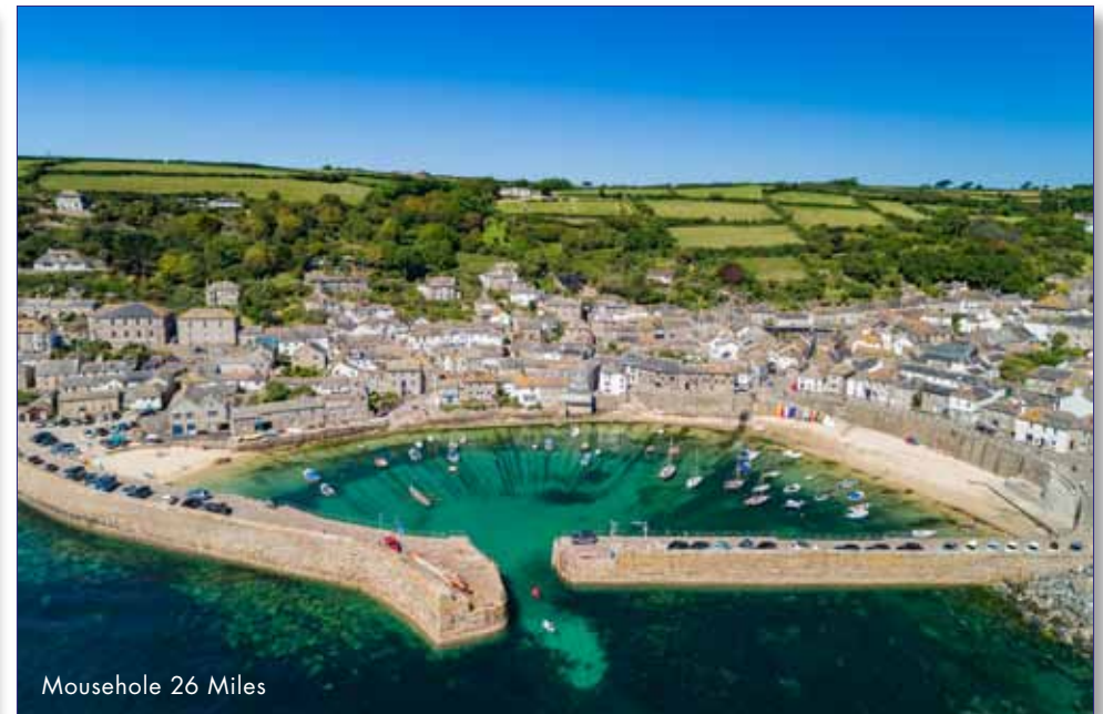
Mousehole 26 Miles