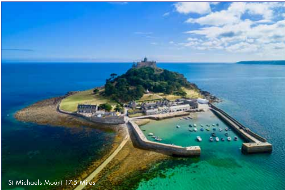
St Michael's Mount 17.5 Miles