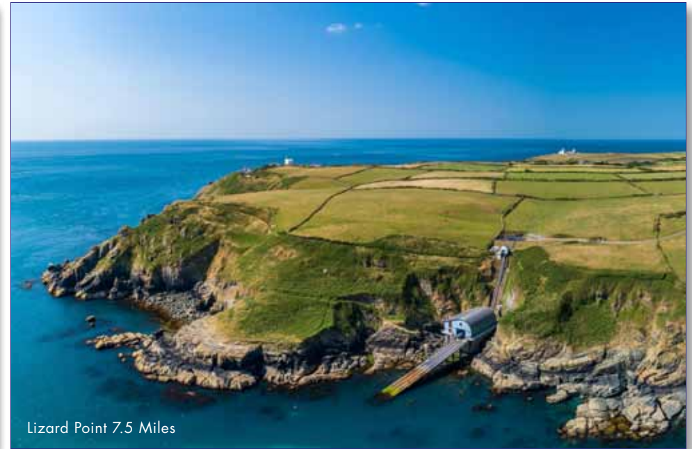
Lizard Point 7.5 Miles