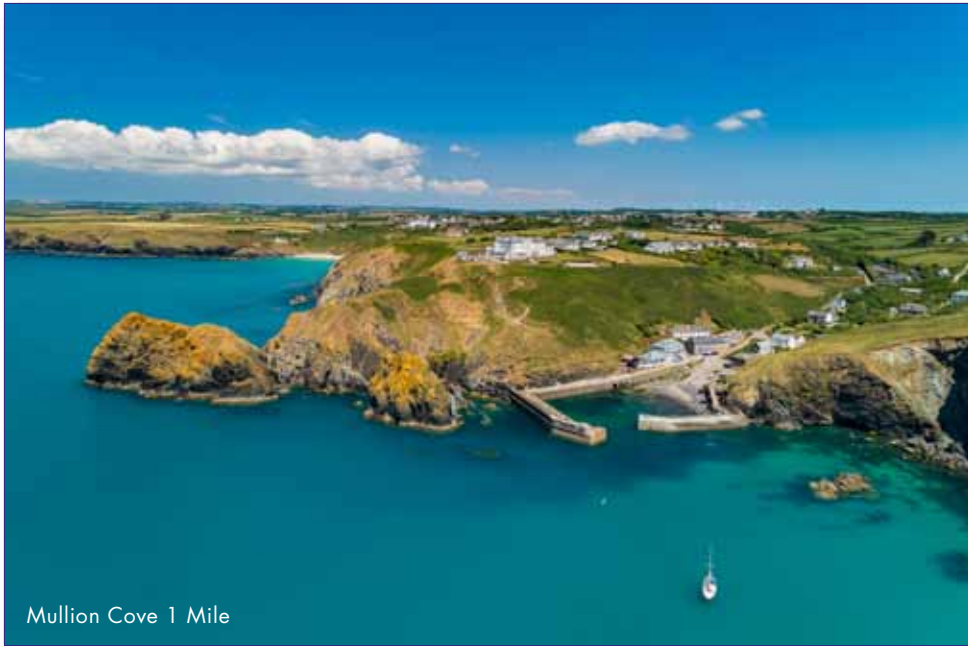
Mullion Cove 1 Mile